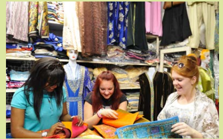
EXPLORE THE SOUKS