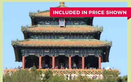
BE INSPIRED BY THE MING TOMBS