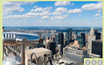
EXPERIENCE THE BEST VIEW FROM THE TOP OF THE ROCK