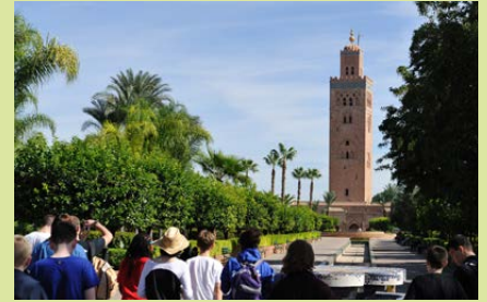
CITY OF MARRAKECH