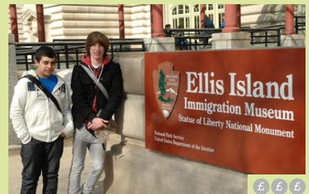
CRUISE TO THE STATUE OF LIBERTY & ELLIS ISLAND IMMIGRATION MUSEUM