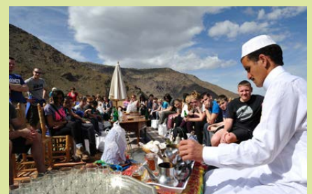
LOCAL MOROCCAN CULTURE