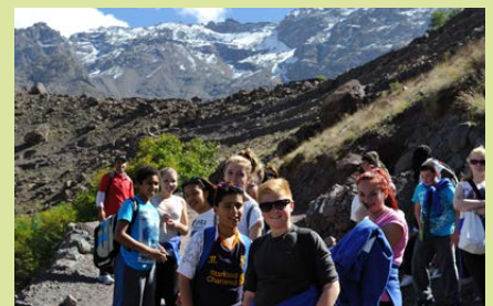
BEAUTIFUL MOUNTAIN SCENERY