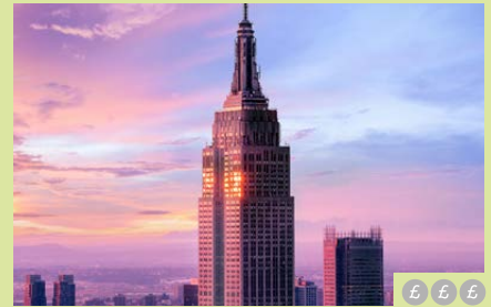
VENTURE SKYWARD UP THE EMPIRE STATE BUILDING

PRICING KEY FOR VISITS FREE £ £ £ £ £ £ £ Free Under £5pp Under £10pp £10pp+