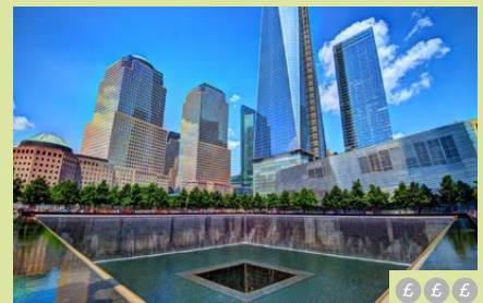
TAKE TIME TO REFLECT AT THE 9/11 MEMORIAL MUSEUM