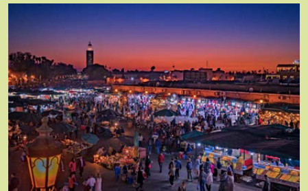
SOAK UP THE EVENING ATMOSPHERE