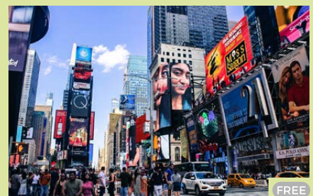
STOP FOR SELFIES IN TIMES SQUARE